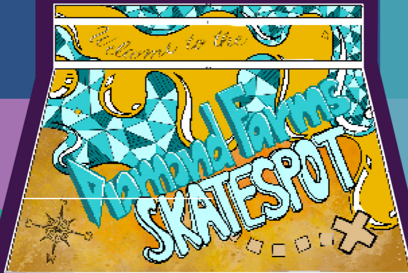
designed by Casey C.